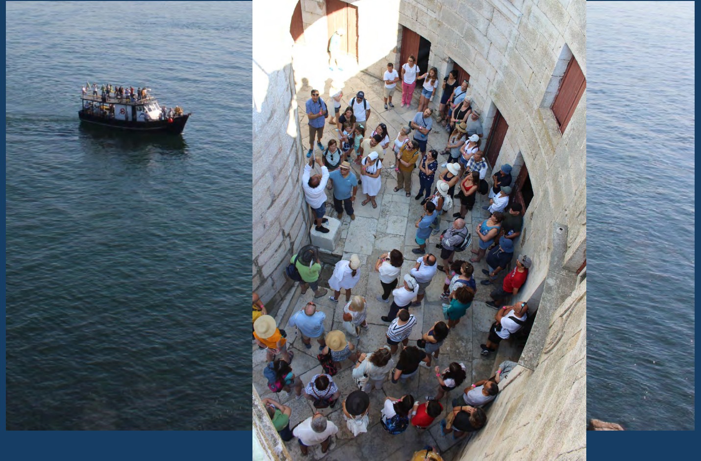
EMACO visit, July 9th 2022, photo by Catarina Macedo.