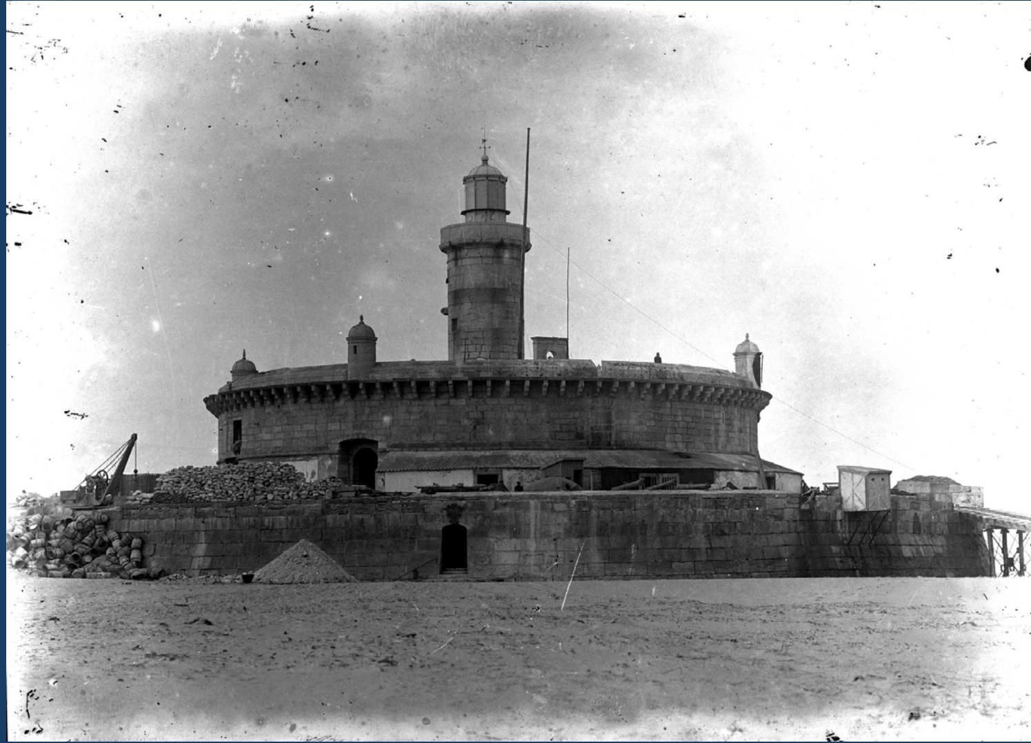
Bugio Fort, maintenance works, 1930-1932