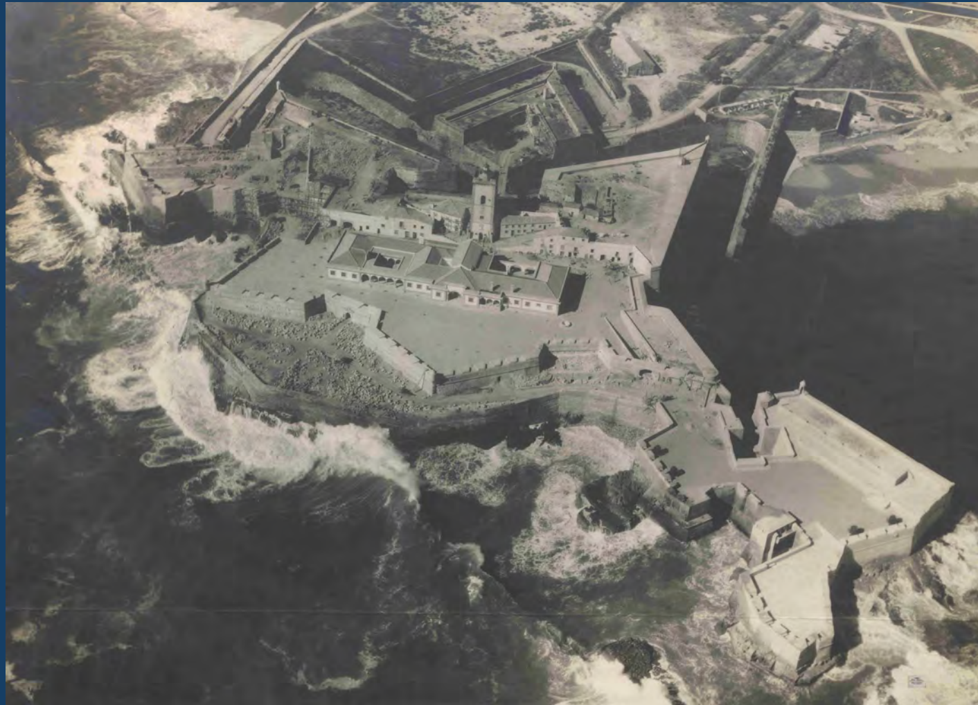
Vista aérea, arquivo municipal de Oeiras