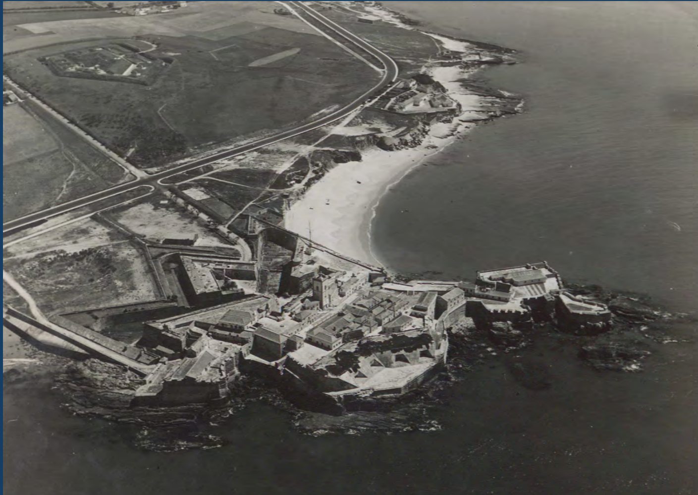
Vista aérea, arquivo municipal de Oeiras