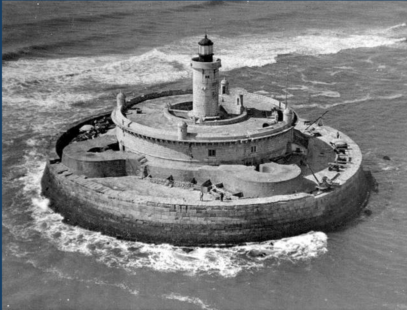
Bugio Fort, aerial view, 1930-1932