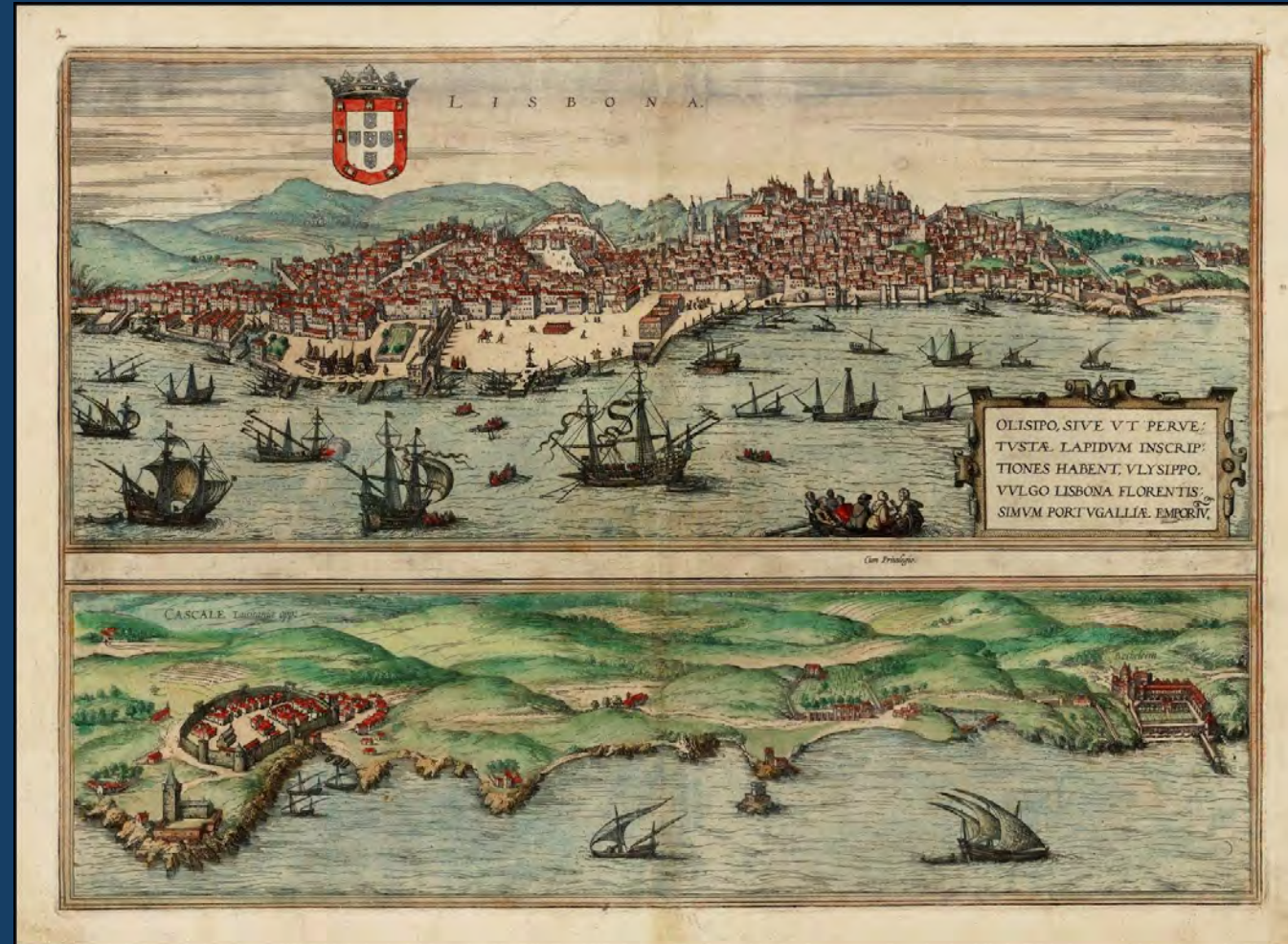
View of Lisbon Coast and city

in atlas "Civitates Orbis Terrarum" de Georg Braun e Frans Hogenberg, Cologne, 1572.