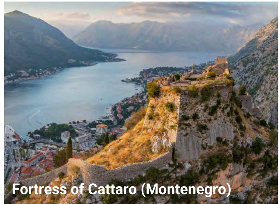
Fortress of Cattaro (Montenegro)