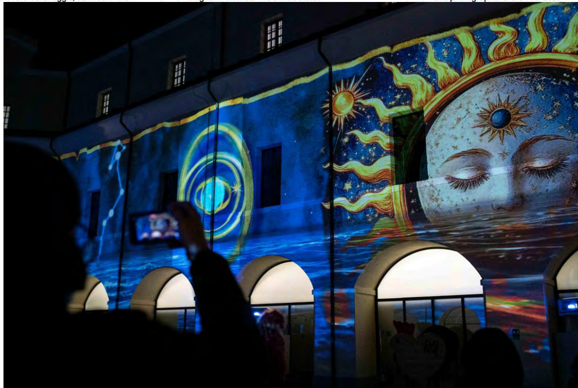
Bottom right: Notizie Piemonte