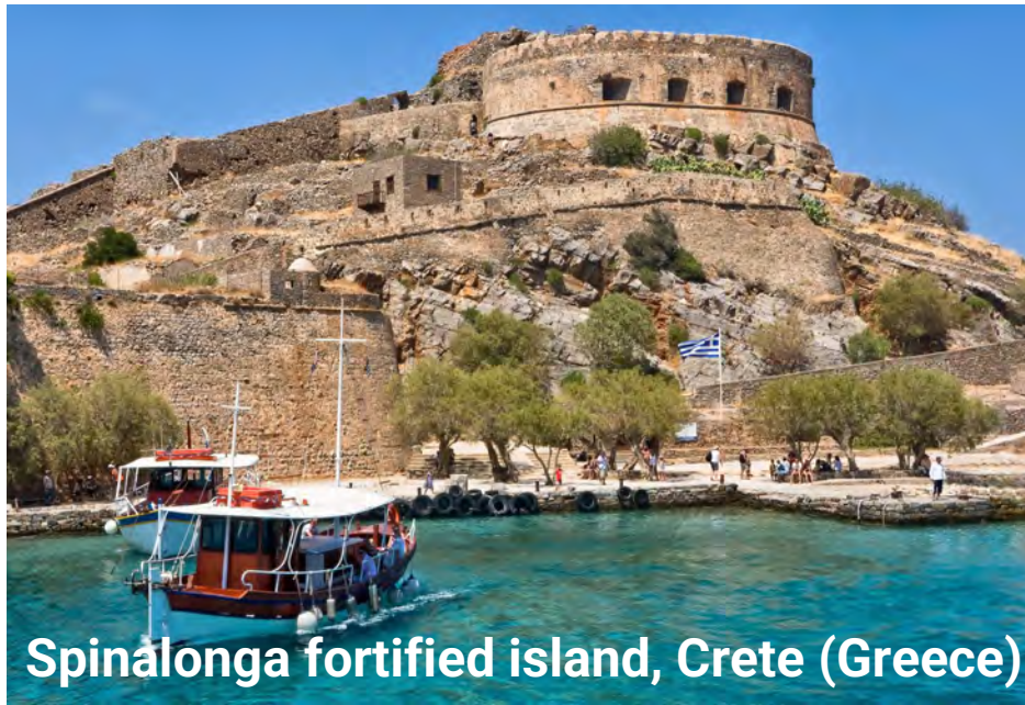
Spinalonga fortified island, Crete (Greece)