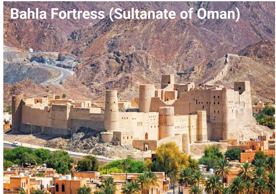
Bahla Fortress (Sultanate of Oman)