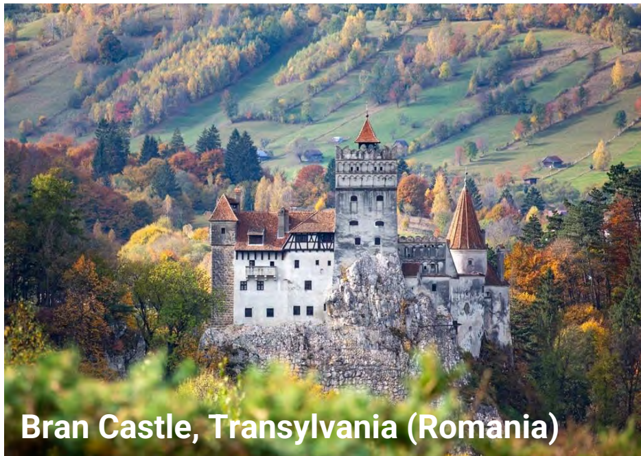
Bran Castle, Transylvania (Romania)